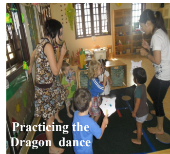
Practicing the Dragon dance