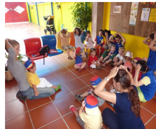
Getting ready for snack with our new friends

It was such fun to make new friends in the playground at TND. We played outside on the trampoline and then had a snack altogether.