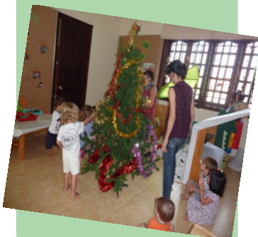
Green Group decorated the Christmas tree

Celebrating Tet was so much fun! We made drums and masks, and danced around like the Dragon. We made and tried some special food, including coconut sweets and Bun Cha Gio. We even loved the Nuoc Mam (fish sauce).