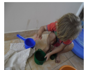
Valentino dries the pots

learning opportunities, helps them take responsibilities and can make things easier for you!